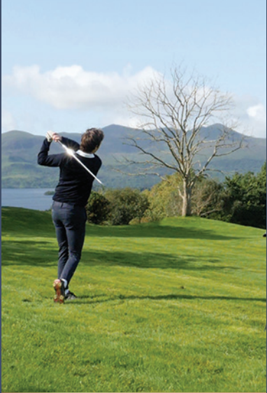
Par 36 Parkland Golf Course