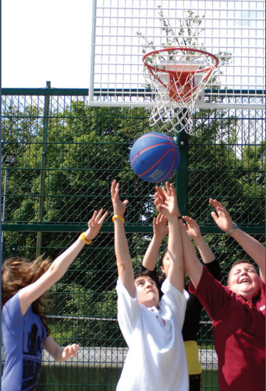
Tennis & Basketball Courts